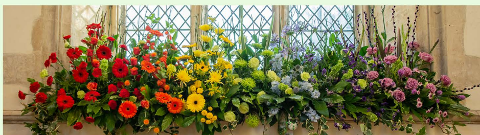
Spectrum by Bourne End Flower Arrangement Society