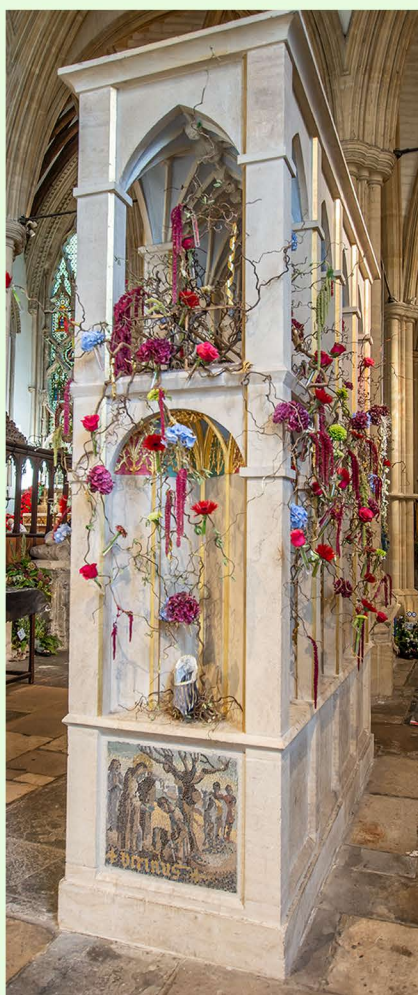
Twists and Turns by Caversham & Chiltern Flower Club