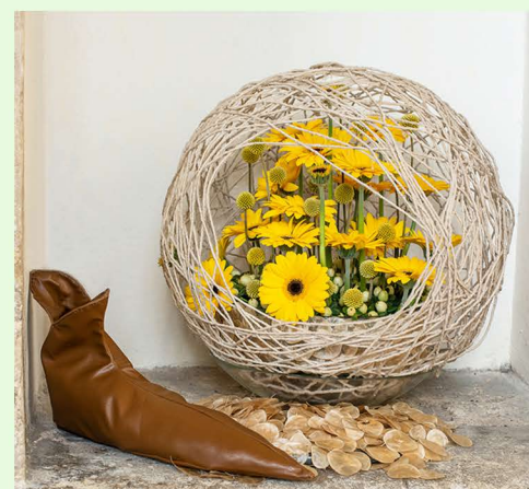
Pilgrims Pennies by BB&O Teachers Association