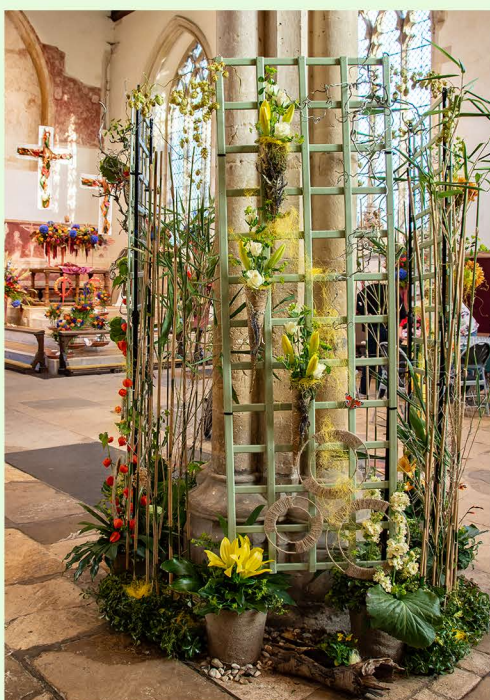
Nature's Joyous Journey by Twyford & Ruscombe Flower Club