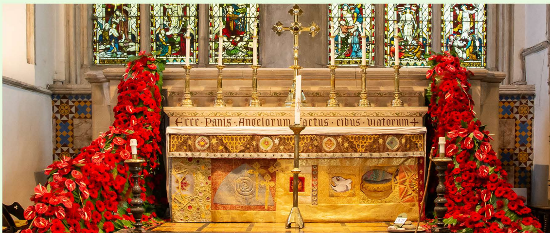
Exodus by Phoenix Design