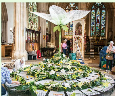
Greys Flora staging Prayer Labyrinth