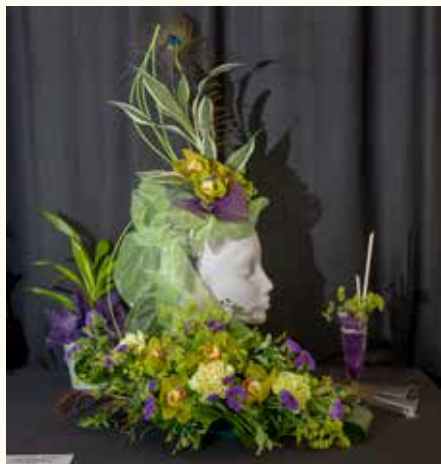
People's Choice winner: Garden Party by Pat Dibben