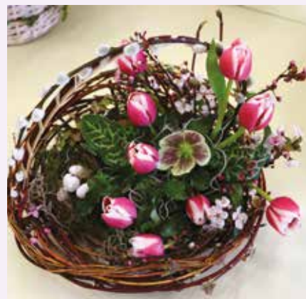
Easter Basket – People's Choice – Sue Starr from Stony Stratford