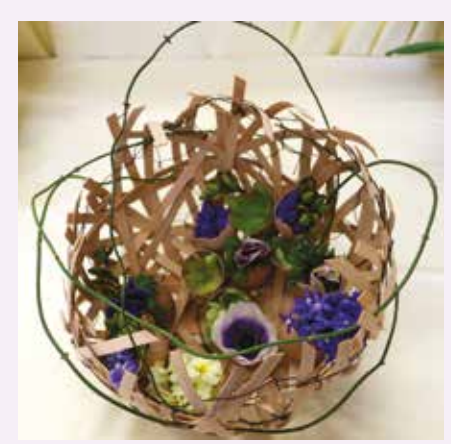
Easter Basket - Judges Choice - Shirley Sexton from Caversham & Chiltern