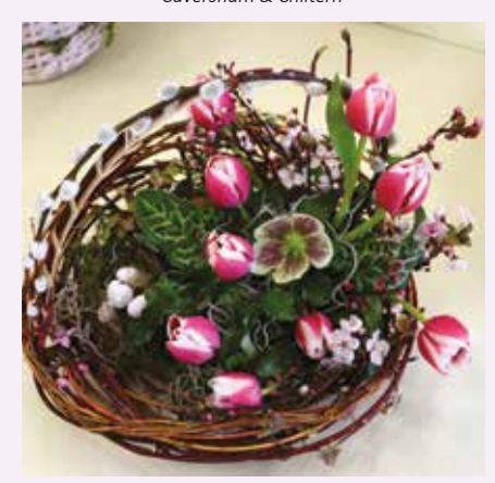
Easter Basket – People's Choice – Sue Starr from Stony Stratford